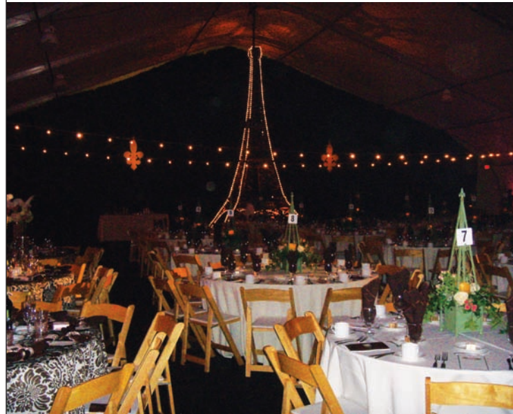
An evening under the Parisian sky