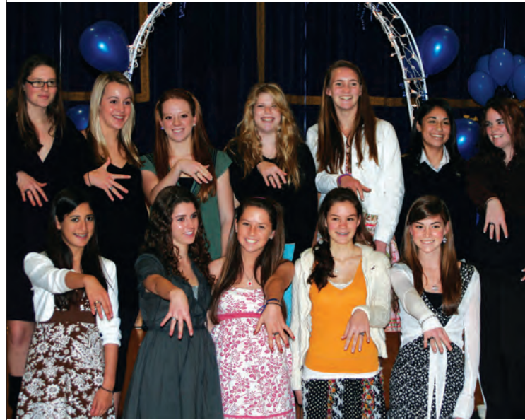
2010 Daughters of Alumnae