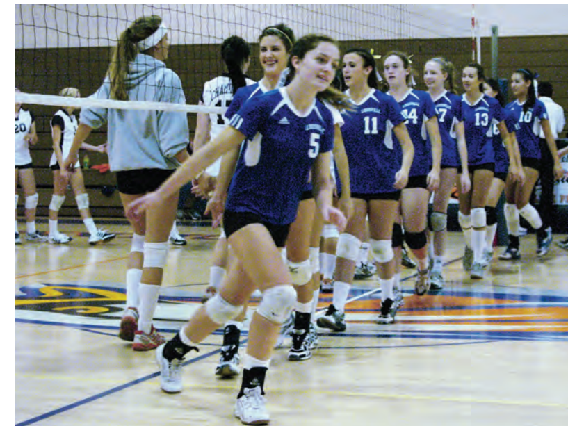
Victorious volleyball team displaying sportsmanship after defeating Chaminade